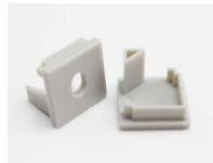
Square End cap with hole Square End cap without hole