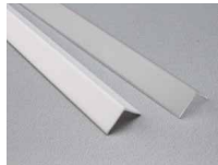
White square lens (WHS) Frosted square lens (FRS)