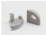
Round End cap with hole Round End cap without hole