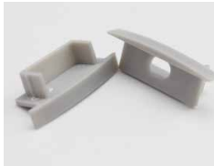
End cap with hole End cap without hole