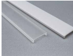
Frosted lens (FR) White lens (WH)