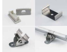
End cap with hole End cap without hole Mounting clip (CP) Pivot clip (PV)