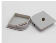
Square end cap with hole Square end cap without hole