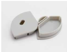
Round end cap with hole Round end cap without hole