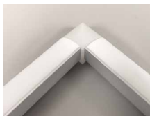
90° connector (round lens only, outside corner only) not included Part# CH-C-016-90