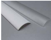
White round lens (WHR) Frosted round lens (FRR)