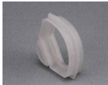
Straight coupler included with round lens option