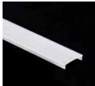
White Lens (WH)