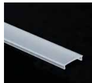
Frosted Lens (FR)