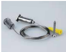
Suspension Cable (SP)