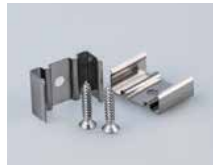
Metal Mounting Clip (MT)