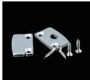
End Caps (EC)