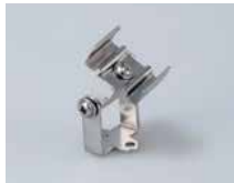
Pivot Mounting Clip (PV)