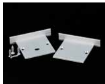
End Caps (EC)