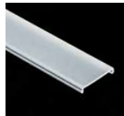
Frosted Lens (FR)