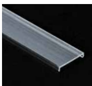
Clear Lens (CL)