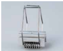
Spring Clip (SG)