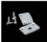
End Caps (EC)