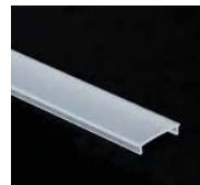
Frosted Lens (FR)