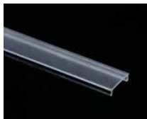
Clear Lens (CL)