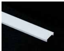
White Lens (WH)