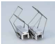
Spring Clip (SG)