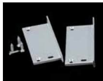
End Caps (EC)