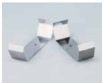
Mounting Clips (CP)