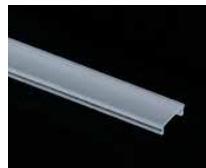
Frosted Lens (FR)