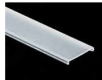
Frosted Lens (FR)