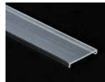
Clear Lens (CL)