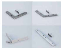
90°, 120° & 180° Connectors