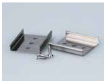
Metal Mounting Clips (MT)