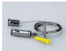
Suspension Cable (SP)