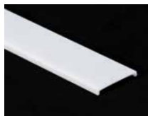
White Lens (WH)