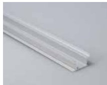
Aluminum Profile A