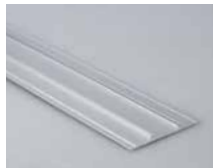
Aluminum Profile B