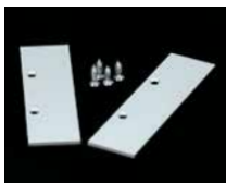
End Caps (EC)