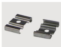
Mounting clip (CP)