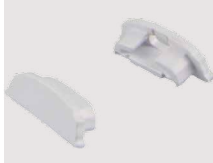
End cap with hole End cap without hole