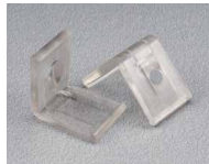
Mounting clip (CP)