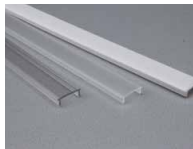
Clear lens (CL) Frosted lens (FR) White lens (WH)