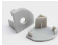
End cap with hole End cap without hole