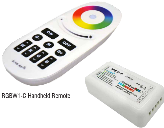
RGBW1-C Handheld Remote